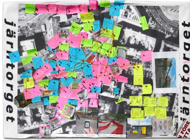
Figure 3. The map after the annotation process in the workshop; the disappearing physical square.

The groups had to discuss the findings during the day, and augment and intensify three different aspects of the shared design space in the context, meaning public, private and commercial space. The three groups had to deal with one type of space each and in their work and presentation be aware of eventual overlaps, shared interests or conflicts with the other groups. Furthermore we asked the groups to make interventions without relating to the other themes, so that e.g. the group working with commercial spaces did not consider whether or not their idea would be disturbing to the ideas or goals of the group working with public space. In addition to this, the interventions had to activate and combine observations in the different layers. They should investigate how different types of use and phenomenon's of the public space, positive and negative, can work together and thereby enhance the three aspects.