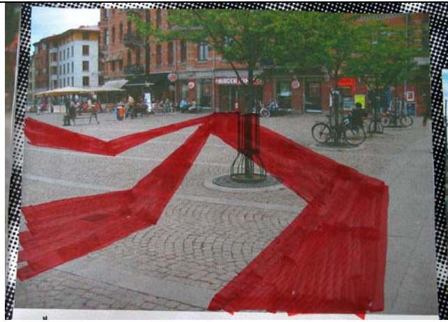
Figure 6. Design proposal from the workshop; Red digital tracks leading the flow of potential customers into the fast food restaurant.

Apart from the actual design proposals, there were a number of interesting findings to be found from the paper representation of the square on the table. The map stores the layers of information, but also information about what was most relevant or inspirational for the ideas. The designers were asked to link the different data they had used in their ideas with a physical thread, so that one would get a visible proof of both the information but also the location of it. There were interestingly two needles that had been used in almost all the projects, and they were an advertisement board and the culture of illegal posters, both located very centrally on the square.