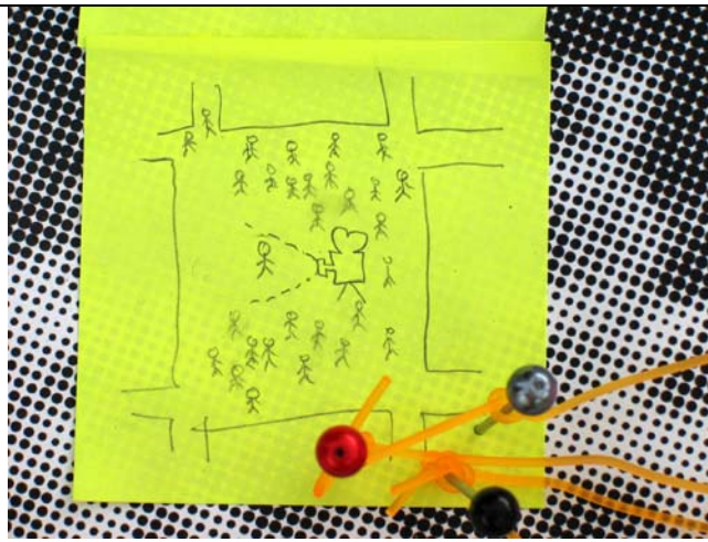
Figure 4. Design proposal from the workshop; A personal sphere is created when the video camera is recording, as people try to avoid exposure to the camera.

Examples of design proposals to enhance the commercial space are: