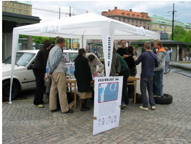
Figure 2. The workshop setup with tent, table, posters, designers and inhabitants.

The setup was an open tent serving as a studio, containing a table in the middle. (See Figure 2). The 2,5 x 0,8 m table was partly covered with a large print of the square, which was attached to thick cardboard. A web-camera attached to the ceiling of the tent, documenting the activities on the table during the day, how the original map was covered with observations in layer by layer, how it was growing thicker and richer and finally how physical thread was used to link material from different observations together and outputted scenarios for interventions on the map. (See Figure 3).